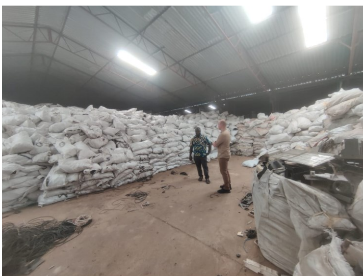
Figure 2: The storage facility for collected WEEE in Accra.