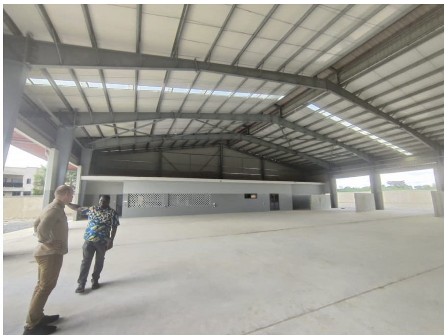
Figure 3: The hall of the new handover centre in Accra. (Photo by David Aladago).

The last station of the business trip was a site visit to the newly built handover centre (Figure 3) in the same area. The handover centre should be used by collectors of WEEE as an official trading point and should also house small recycling businesses. Very inspiring! We are looking forward to the success the handover centre will bring to the collection and recycling sector of WEEE in Accra. Maybe it will host a recycling process for toner cartridges one day!